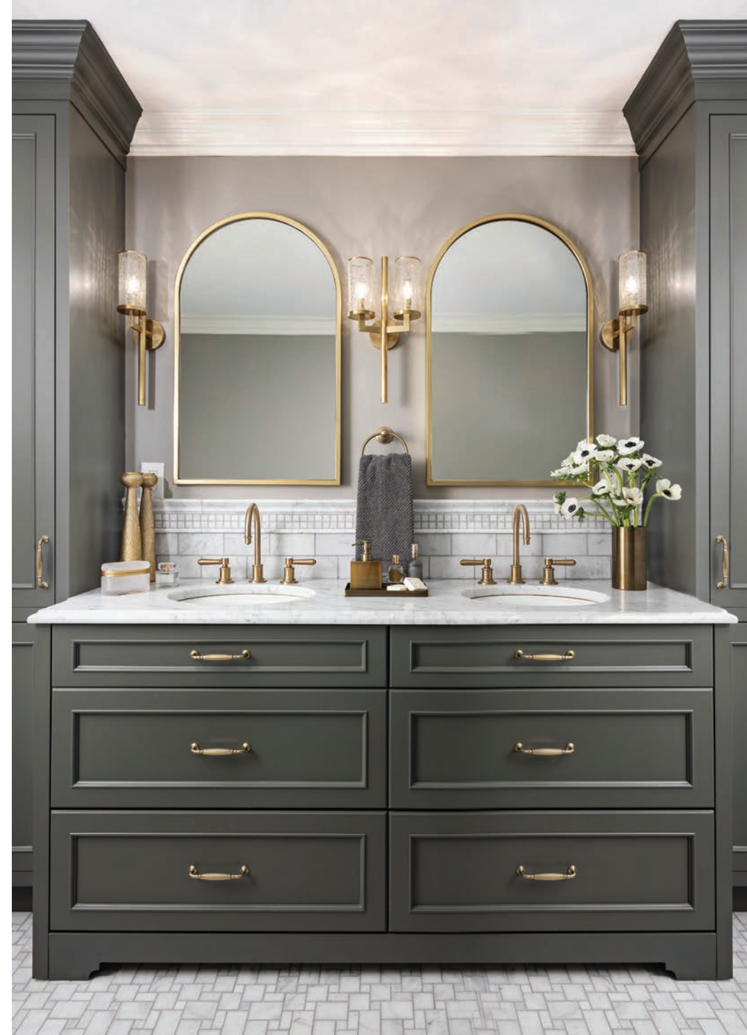
Crestwood Cabinetry shown in Chapel Hill Panel door style with "Rock Bottom" paint.