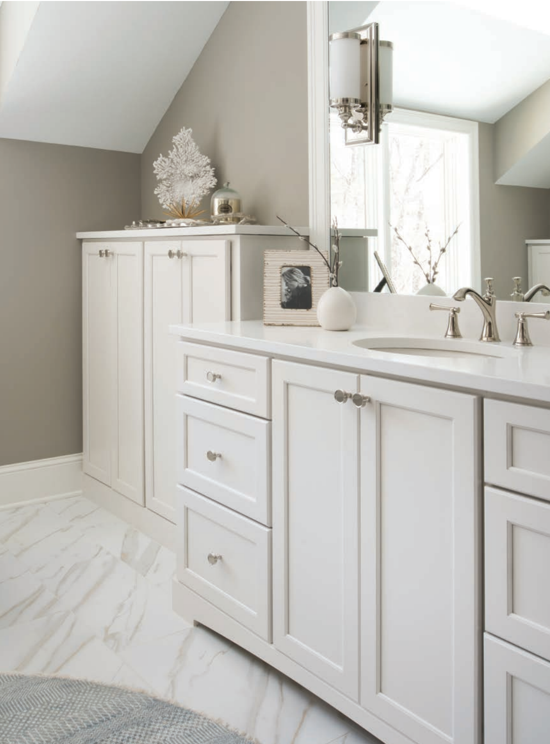
Cabinetry shown in Kendal Panel door style with "Linen White" paint.