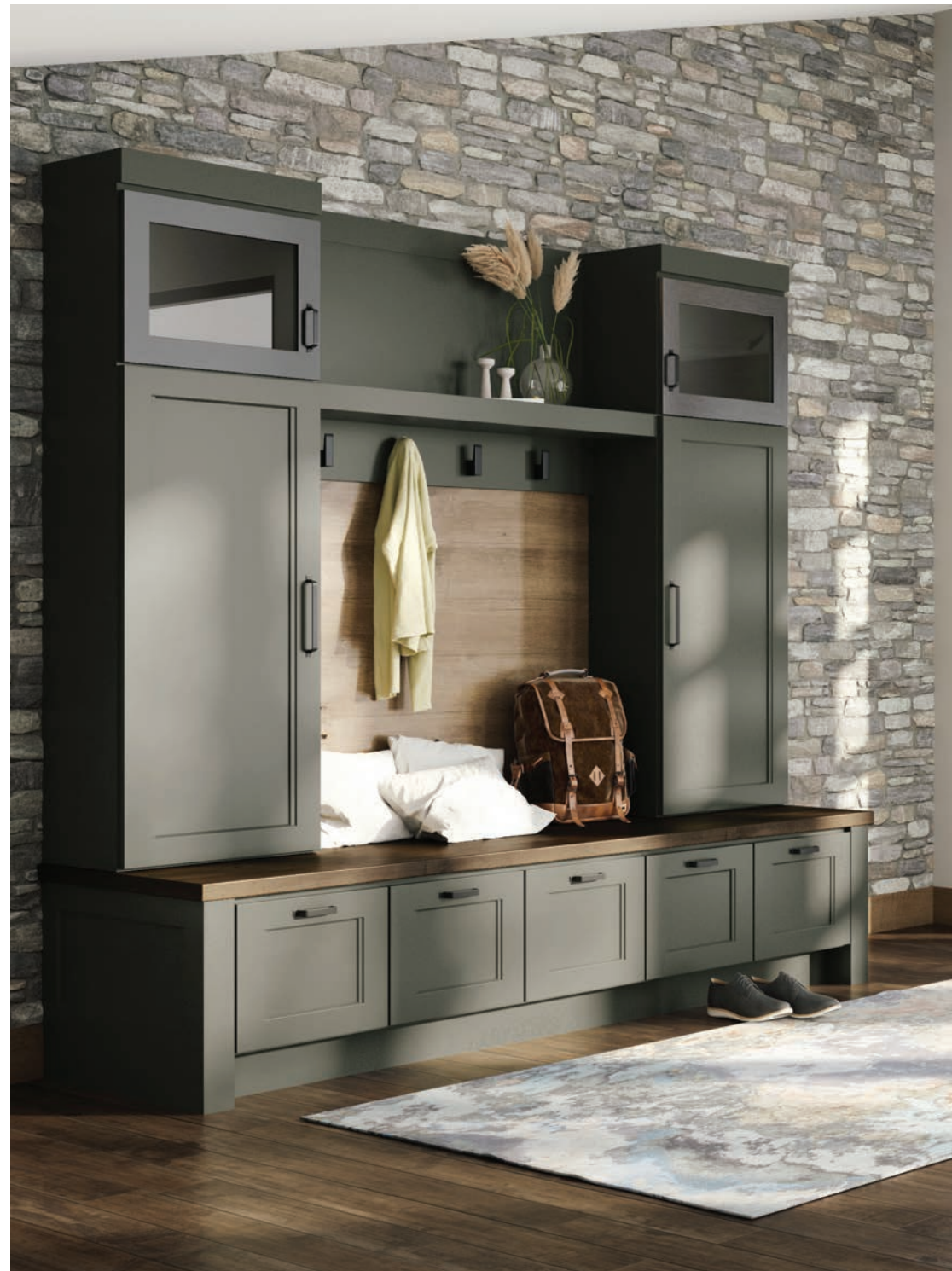
Entryway Locker and Boot Bench shown in Avery door style with “Cast Iron” paint. Aluminum Frame door in “Graphite” finish. Coat hook area is Knotty Alder shiplap with “Heather” stain.