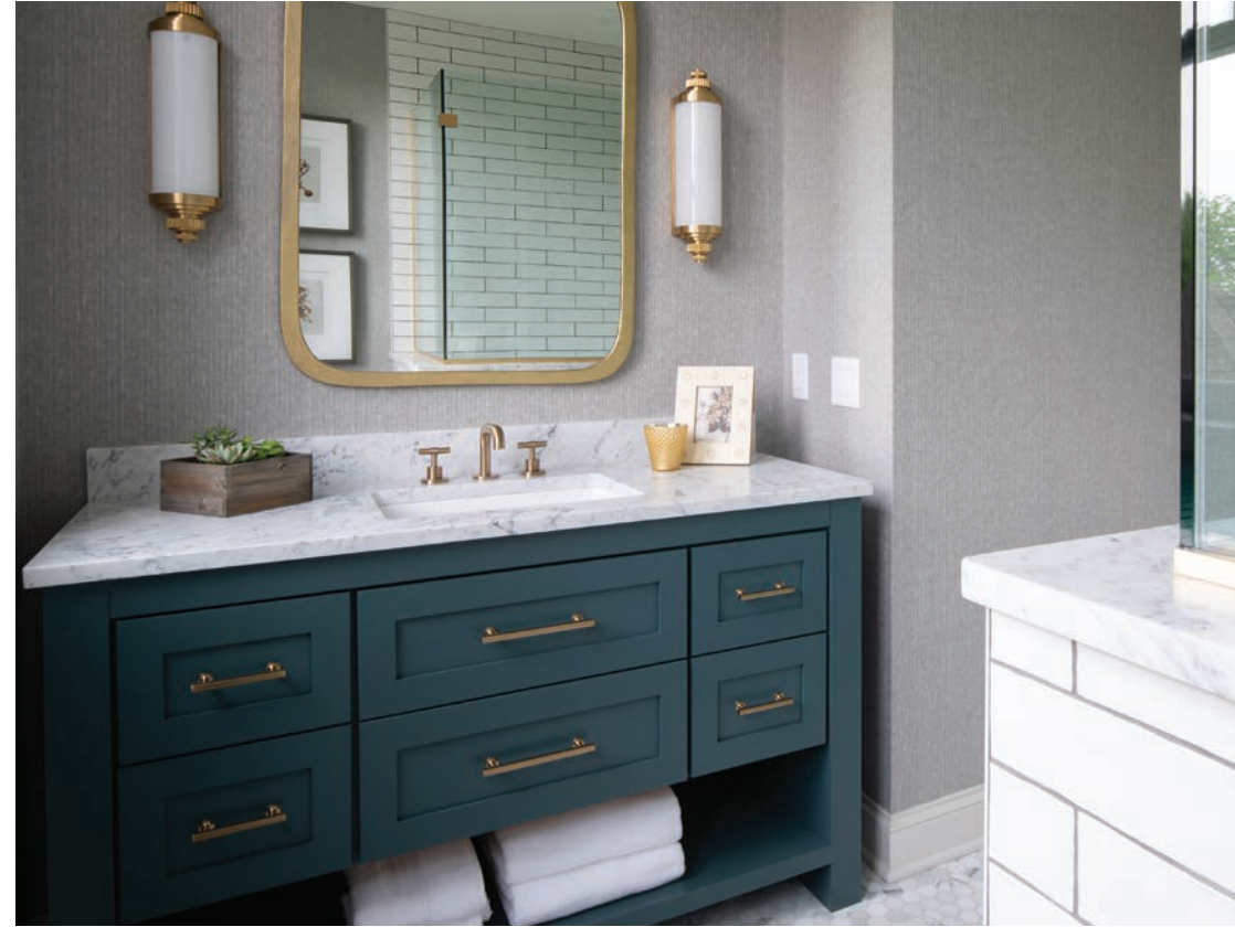
Crestwood Cabinetry shown in Homestead Panel door style with a custom Personal Paint Match finish.

THE BATH HAS EVOLVED from its purist utilitarian roots to a more intimate and reflective sanctuary in which to relax and reconnect. A refreshing spa-like environment offers a brisk welcome at the dawning of a new day or a soothing interlude as your day concludes. Bath cabinetry from Dura Supreme offers myriad design directions to create the personal harmony and beauty that are the hallmark of the bath sanctuary. Immerse yourself in our expansive palette of finishes and wood species to discover the look that calms your senses and soothes your soul.