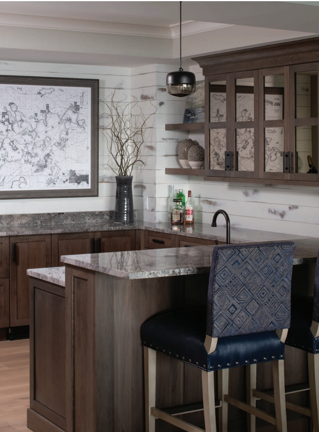
Bria Cabinetry shown in Homestead door style with "Morel" stained finish on Cherry.