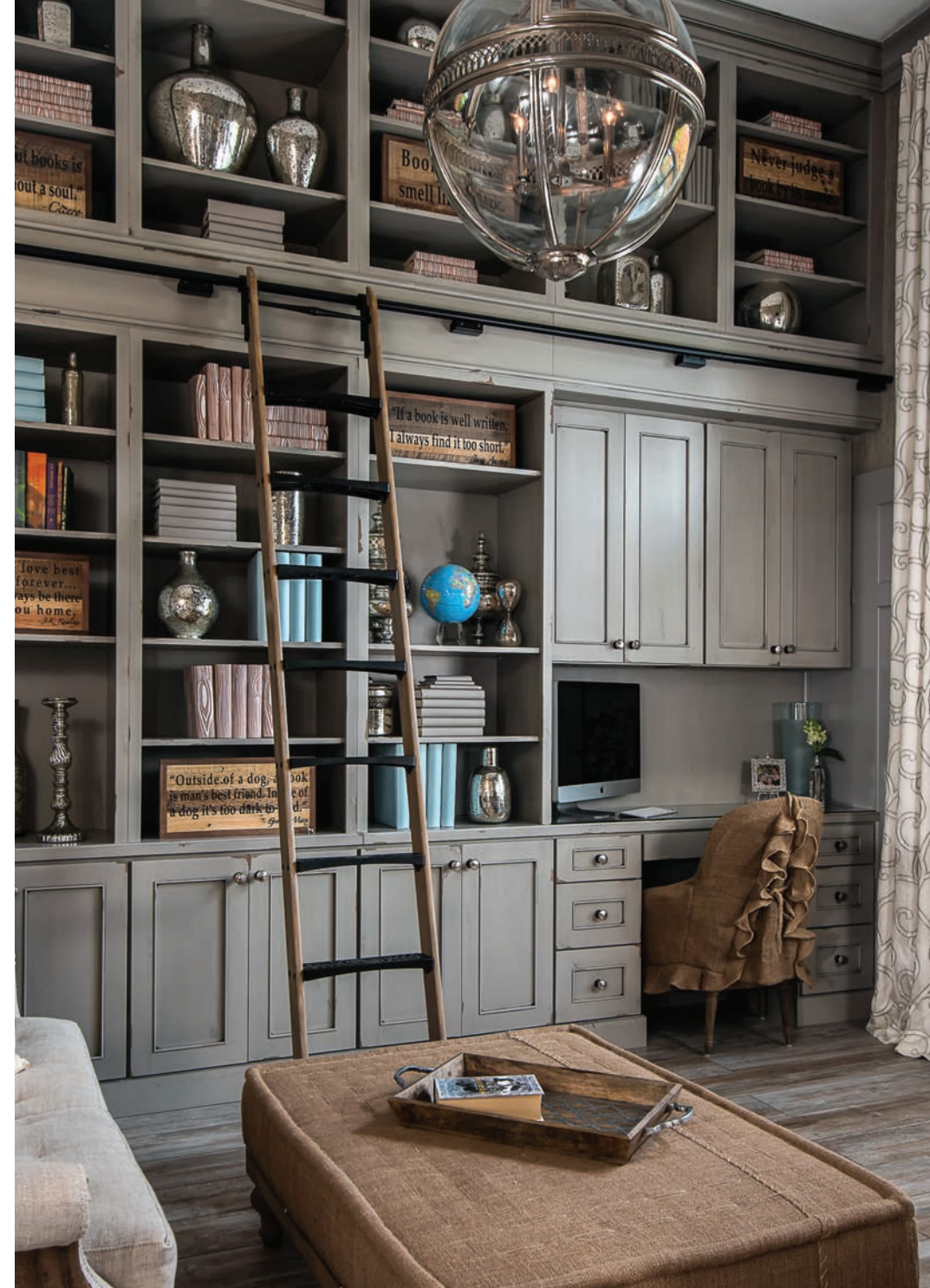
Library is Crestwood Cabinetry shown in Silverton door style with Heritage Paint "H" finish on Maple.