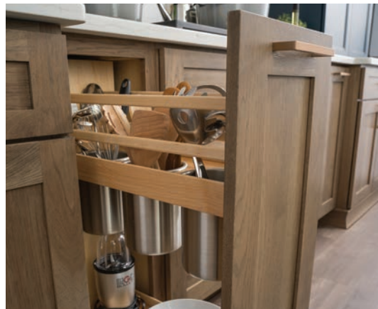
Base Utensil Pull-Out