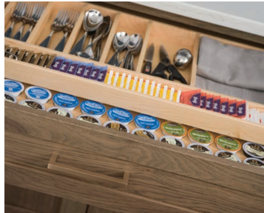
Two-Tier Drawer with K-Cup Organizer