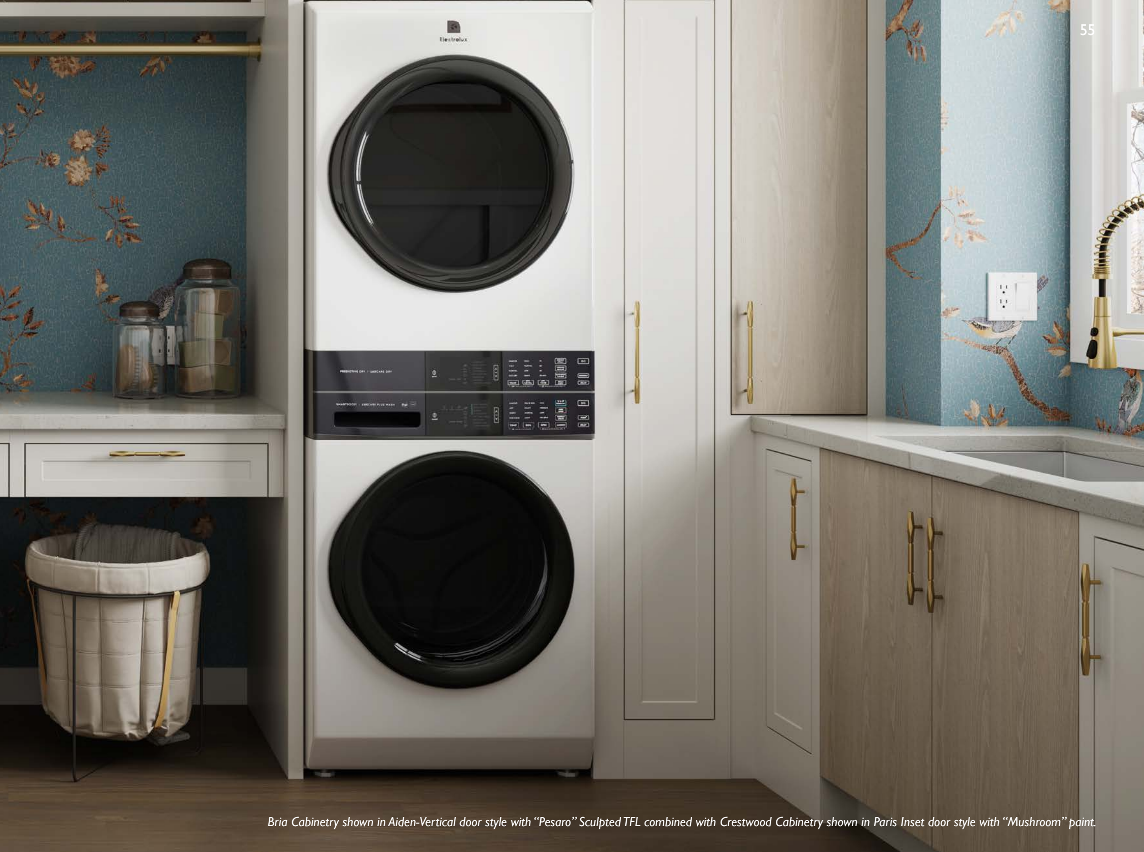
Bria Cabinetry shown in Aiden-Vertical door style with “Pesaro” Sculpted TFL combined with Crestwood Cabinetry shown in Paris Inset door style with “Mushroom” paint.