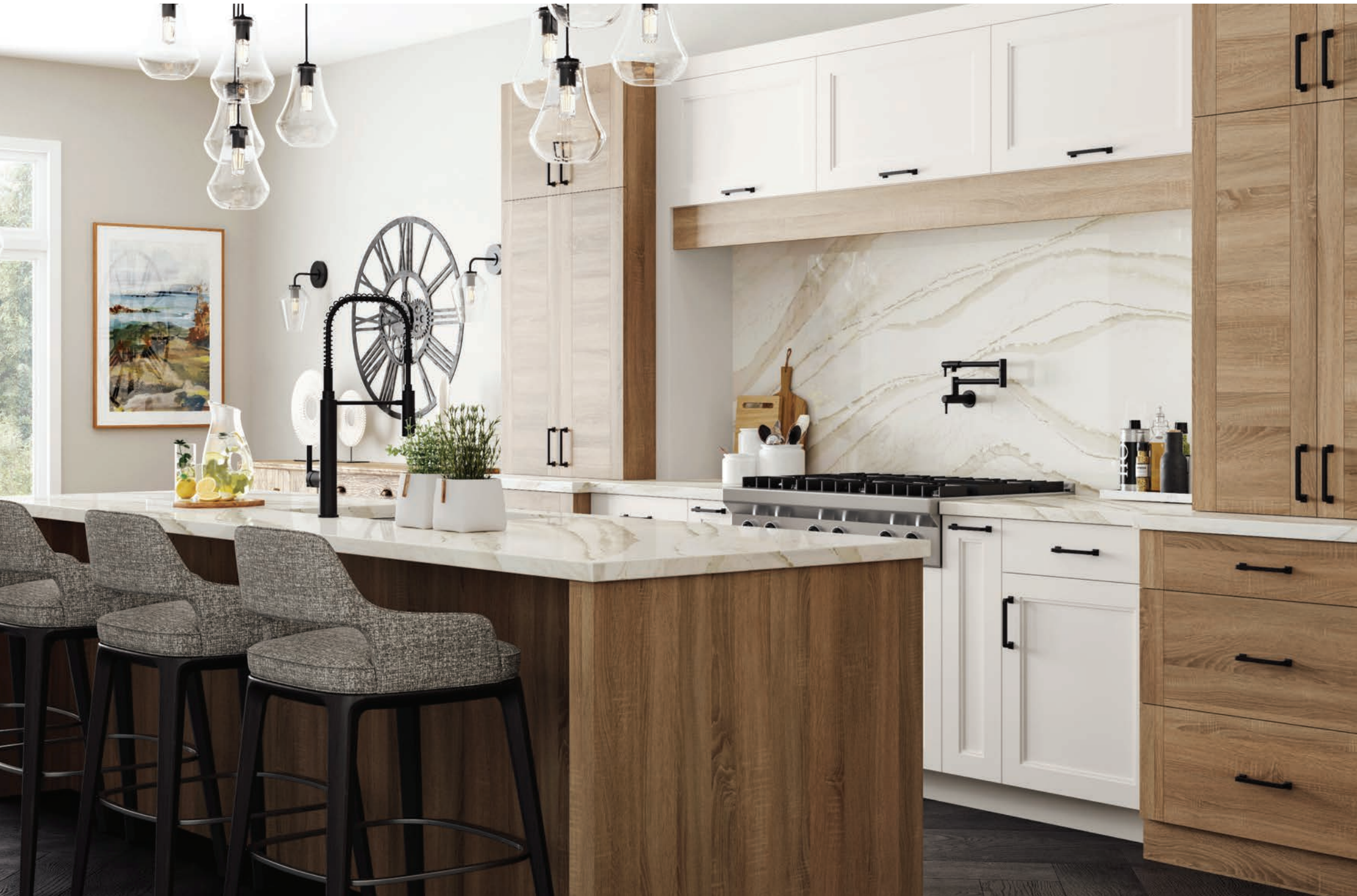
Bria Cabinetry shown in Dash door style with "Lodge Oak" Textured TFL, and Dempsey door style with "Linen White" paint.