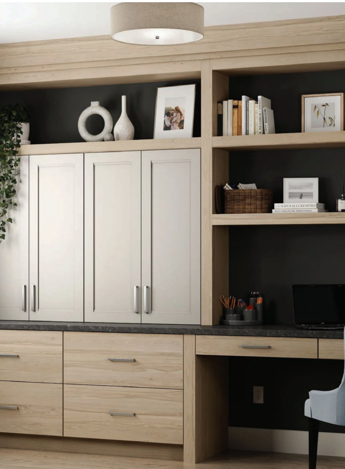
Home office shown in Camden door style with “Cashew” stain on Hickory and Breckenridge Panel door style with “Mushroom” paint.