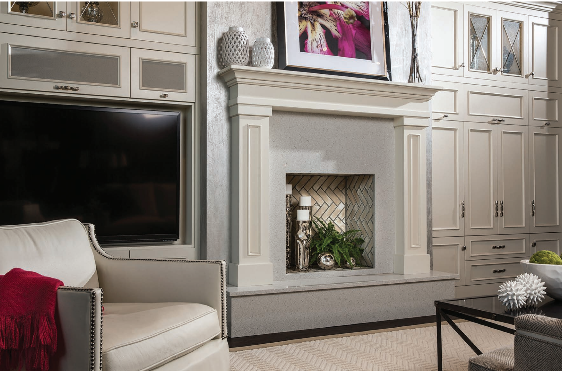
Bria Cabinetry shown in St. Augustine door style with "White/Pewter" Accent painted finish with matching fireplace mantel. Accent doors have Leaded Glass insert LG-45 with Nickel caming.