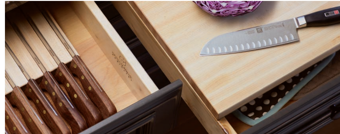
Drawer Knife Holder and Chop Block