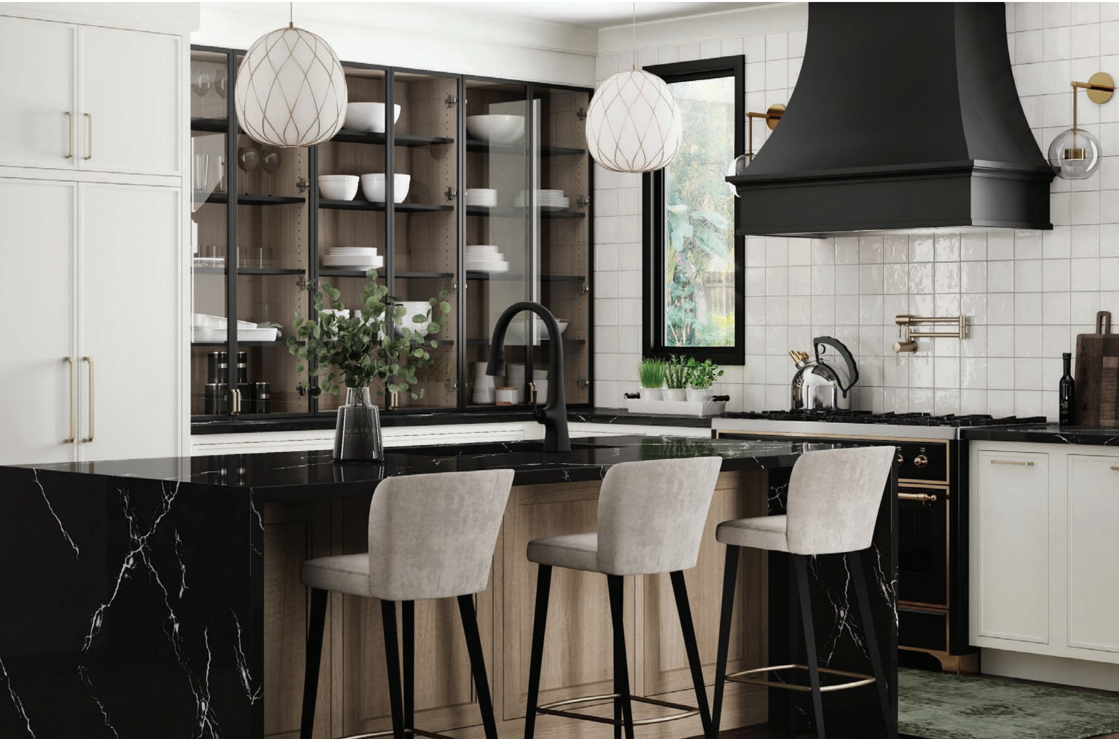
A combination of Crestwood and Bria Cabinetry shown in Reese Inset door style with "Dove" paint, Avery Inset door style with "Coriander" stain on Quarter-Sawn White Oak, and Aluminum Frame Door #1 with "Onyx" finish.