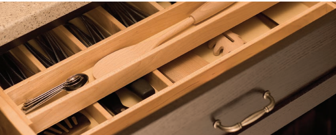
Two-Tier Wood Cutlery Tray