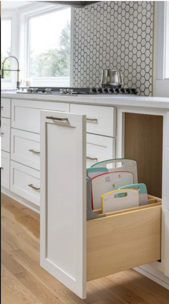
Pull-Out Tray Divider