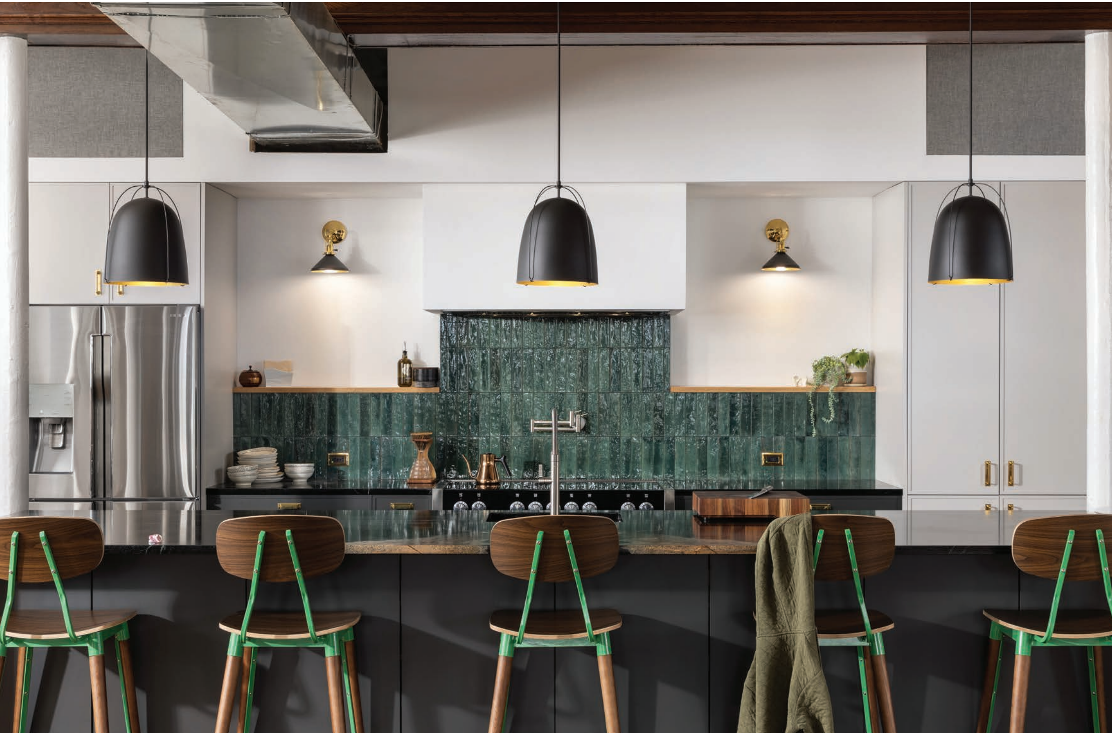
Bria Cabinetry shown in Reese door style with "Pearl" paint and "Graphite" paint.