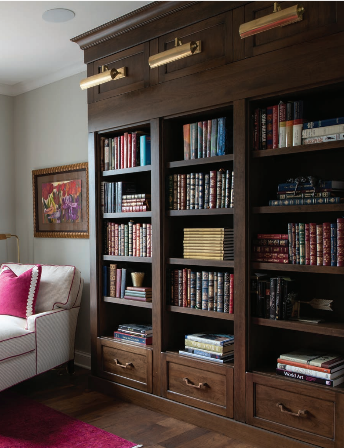
Crestwood cabinetry shown in Kendall Panel door style with Heirloom "O" finish on Cherry.