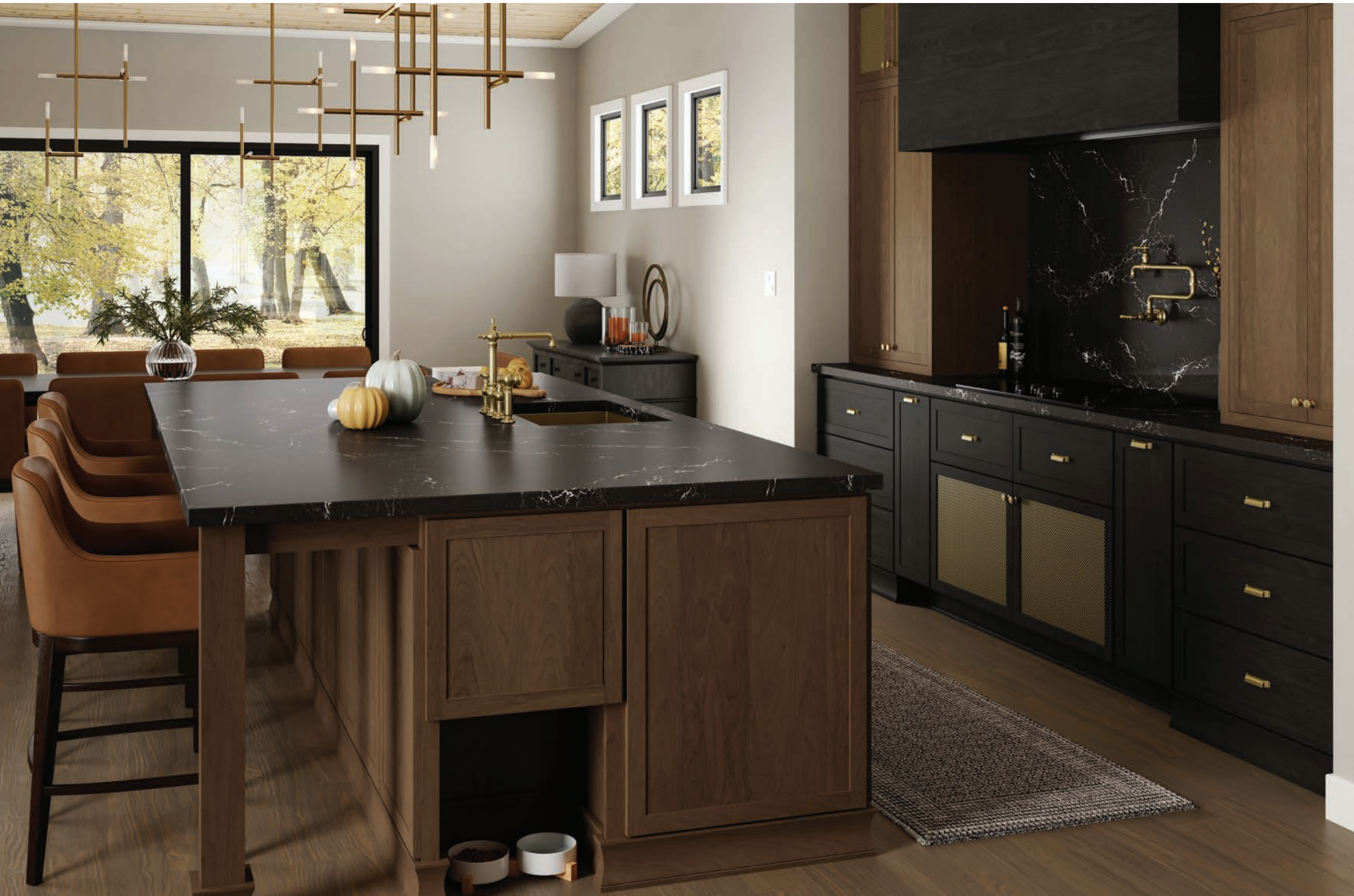
Crestwood Cabinetry shown in Paris door style with a combination of “Onyx” and “Cashew” stains on Cherry with Open Metal Shelves and Wire Mesh Inserts.