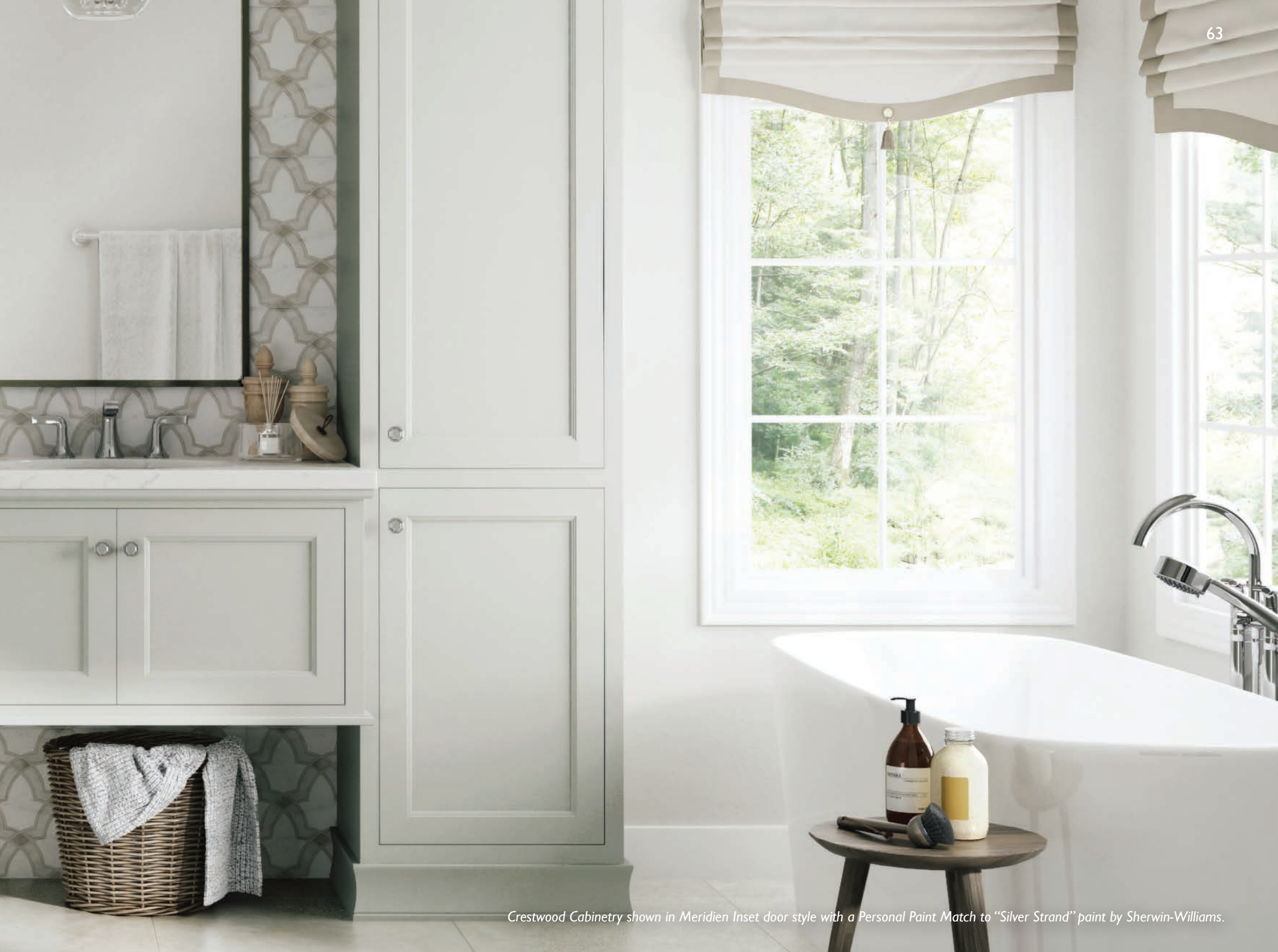
Crestwood Cabinetry shown in Meridien Inset door style with a Personal Paint Match to "Silver Strand" paint by Sherwin-Williams.