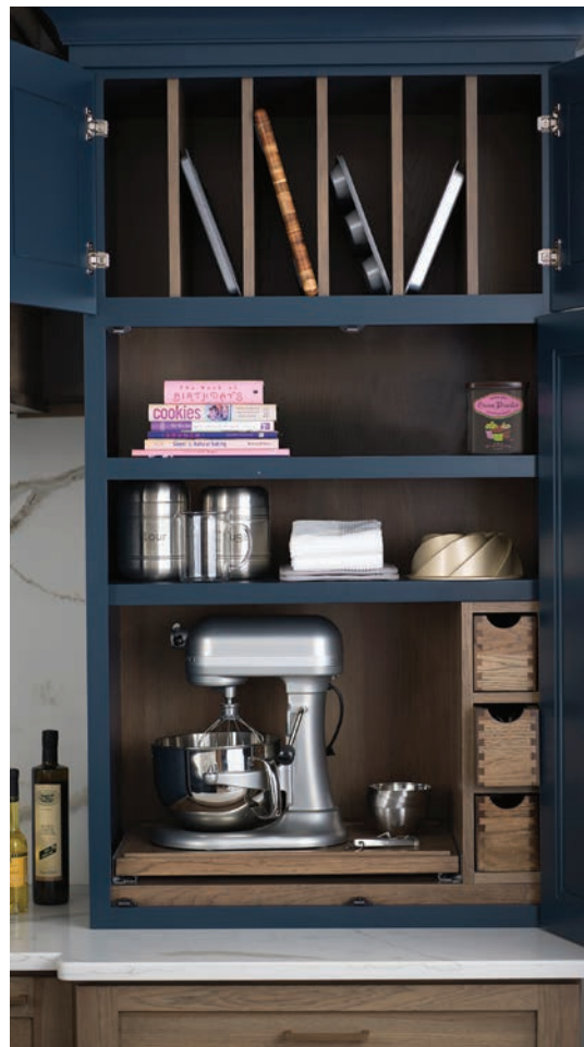
Baking Center Larder Cabinet