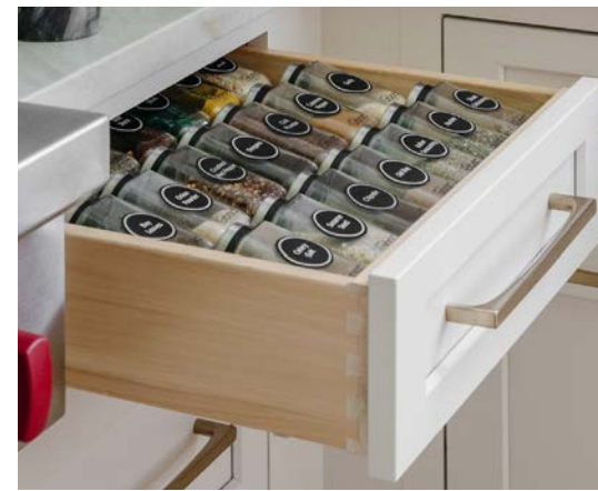
Drawer Spice Rack