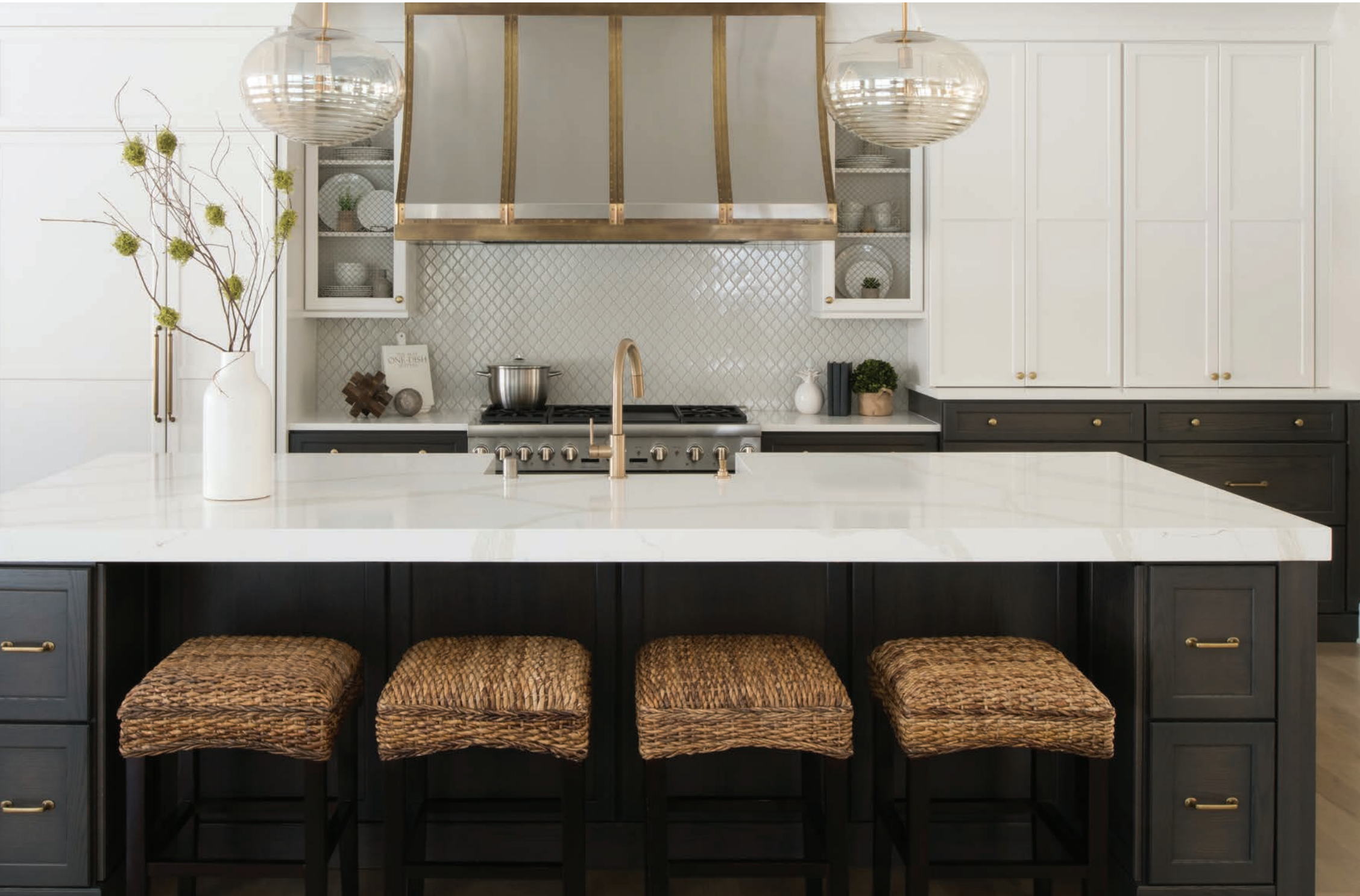
Bria Cabinetry shown in Kendall Panel door style with "Linen White" paint and "Smoke" stain on Red Oak.