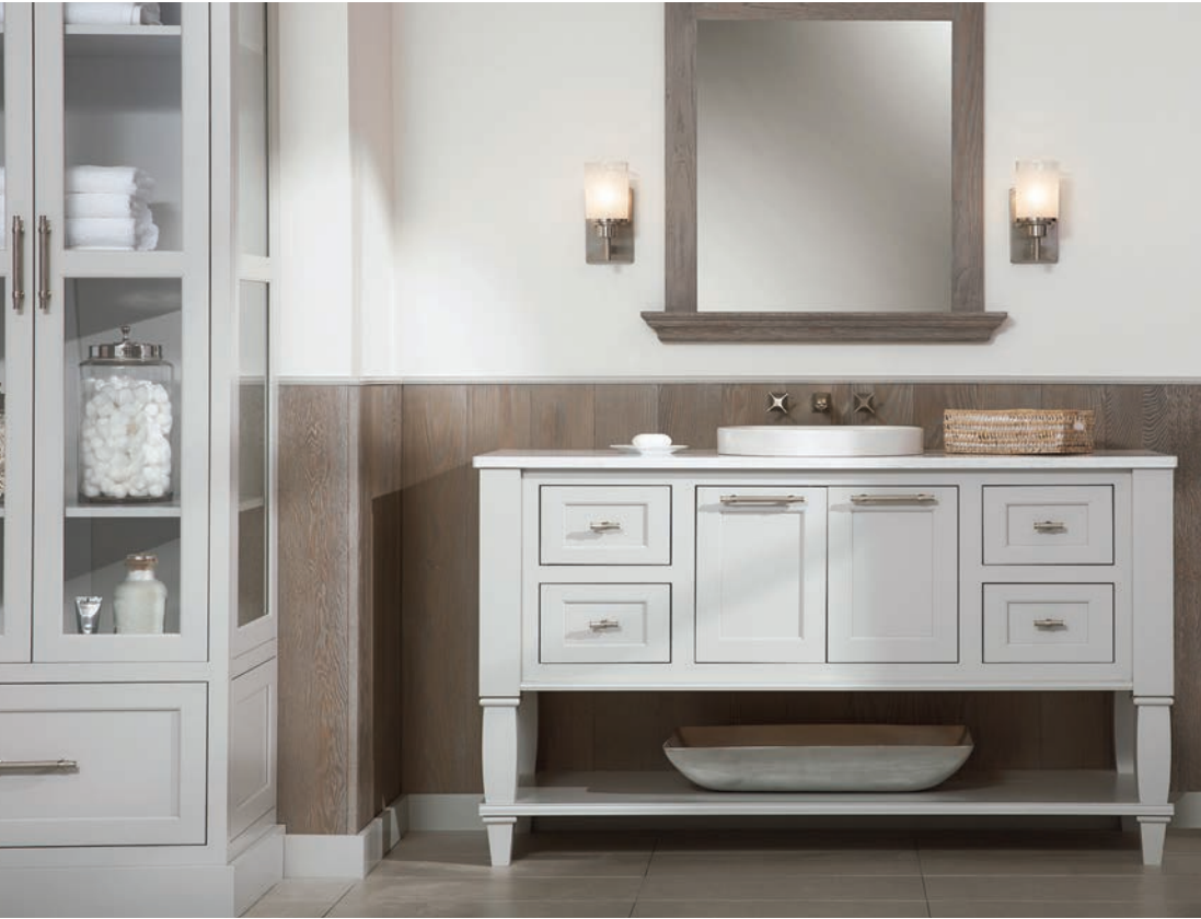
Crestwood Cabinetry shown in Kendall Panel Inset door style with “Silver Mist” paint.