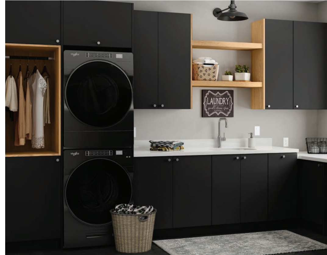
Bria Cabinetry shown in Jace door style with "Black" Matte Foil with accents of "Natural" Red Oak.

WHY CONFINE CABINETRY TO THE KITCHEN? Dura Supreme cabinetry is an intelligent choice for built-in and freestanding furniture pieces throughout your home. As open floor plans gain popularity and kitchen space merges seamlessly with living spaces, it's only natural to extend cabinetry into other areas of the home to create architectural and design consistency. Dura Supreme cabinetry offers an amazing array of door styles, finishes and decorative elements along with superior construction, joinery, quality and custom sizing. Your Dura Supreme dealer can introduce you to a host of intriguing design venues and furniture applications for your entire home.