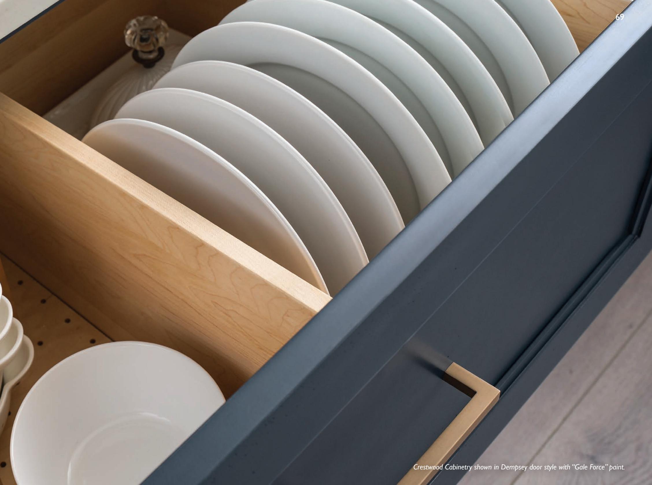
Crestwood Cabinetry shown in Dempsey door style with "Gale Force" paint.