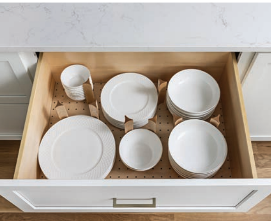
Dish Storage Drawer