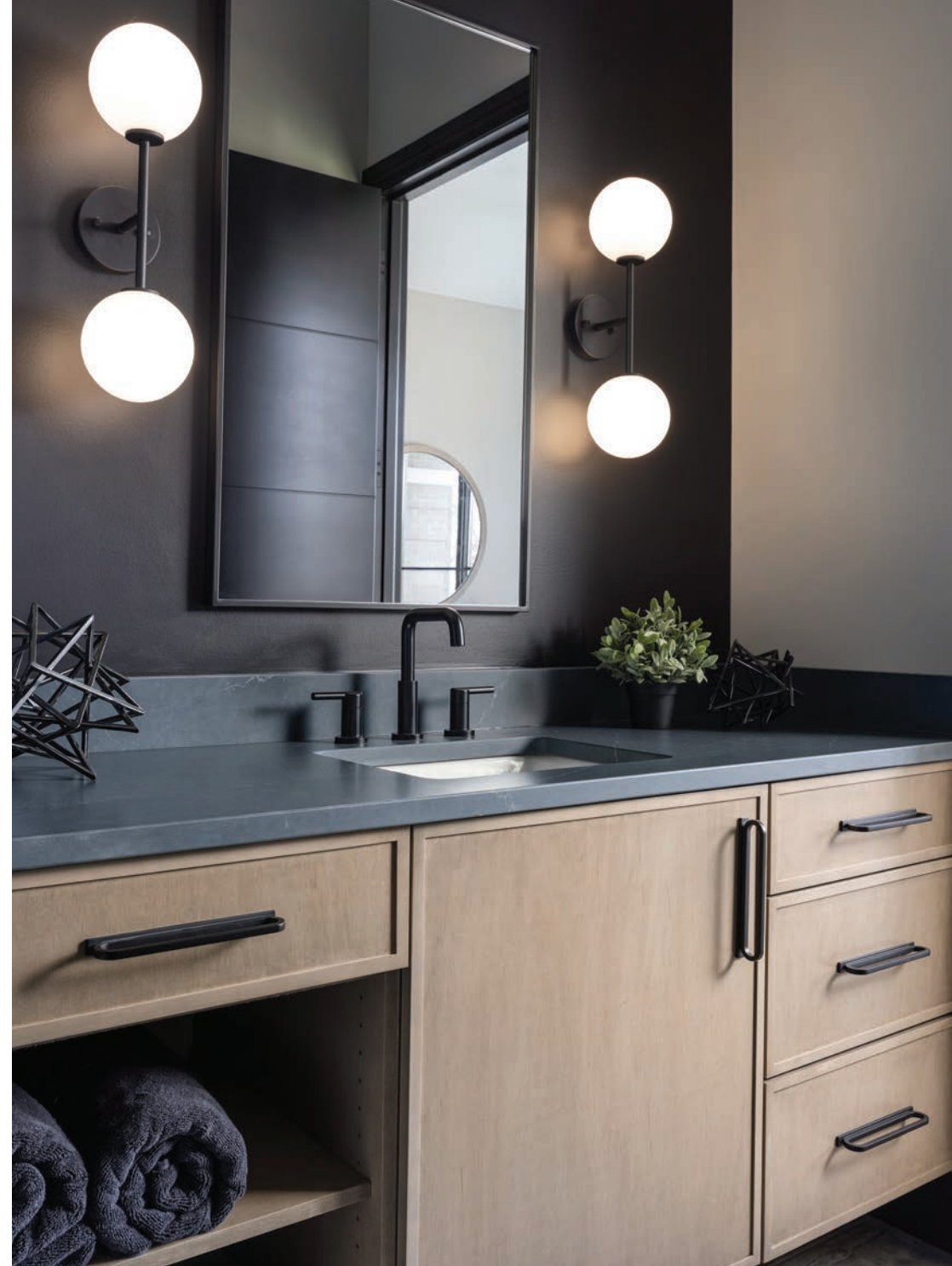
Bria Cabinetry shown with Reese door style with "Cashew" stain on Maple.