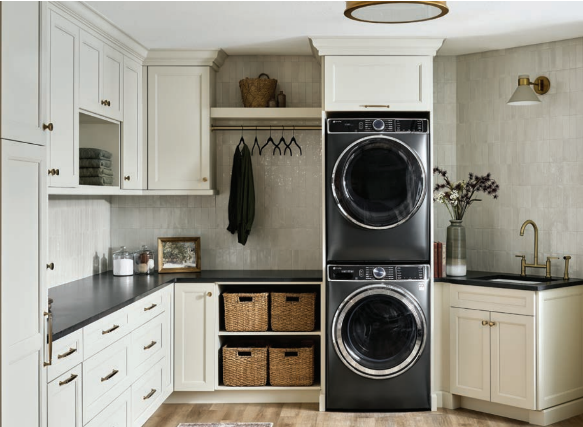
Bria Cabinetry shown in Meridien door style with "Putty" paint.