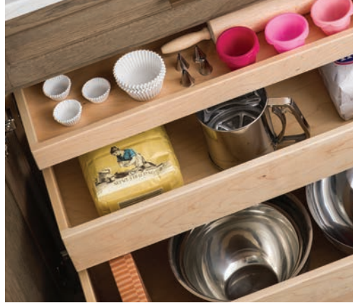
Roll-Out Shelves in Multiple Sizes