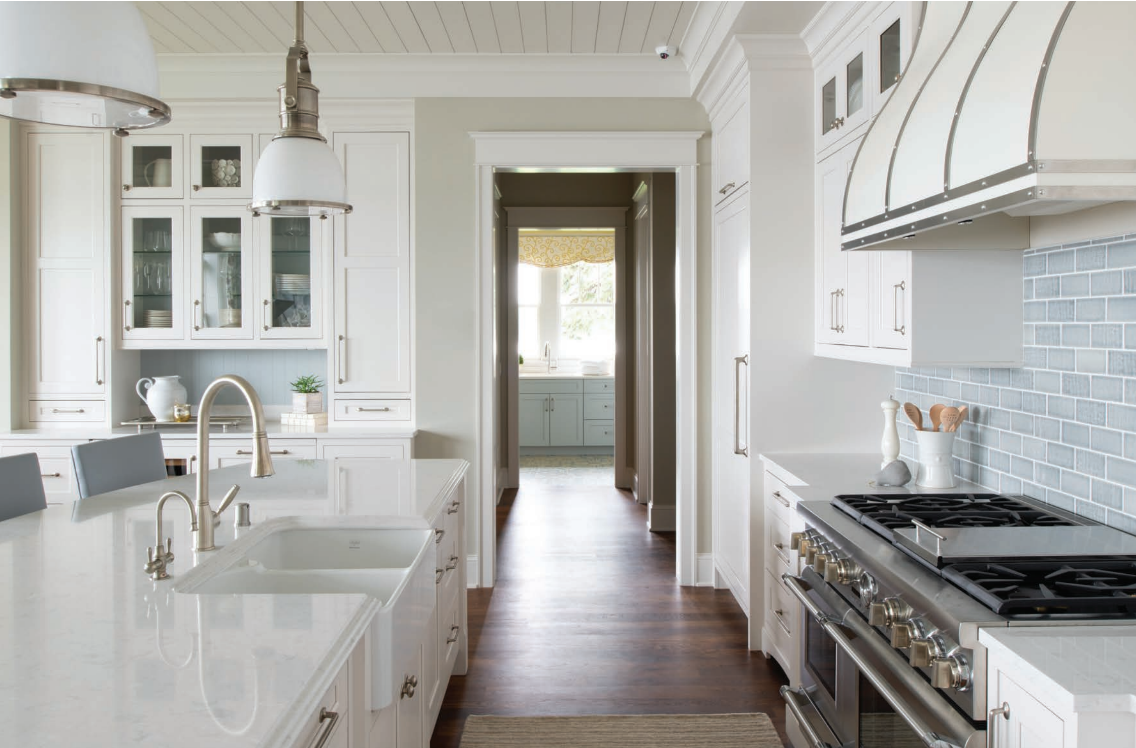
Crestwood Cabinetry shown in Highland Inset door style with "Linen White" paint.