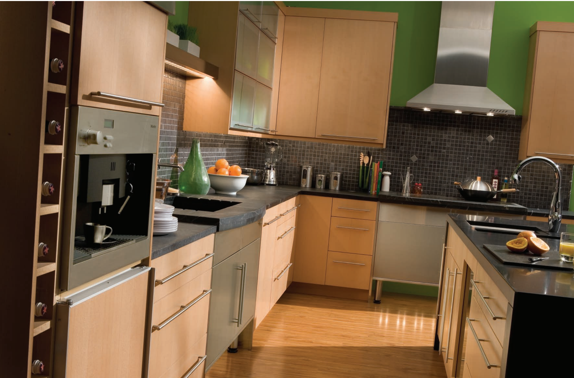
Bria Cabinetry shown in Moda door style with "Natural" finish on Maple. Aluminum Frame doors are also shown.