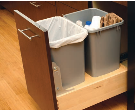
Base Recycling Center