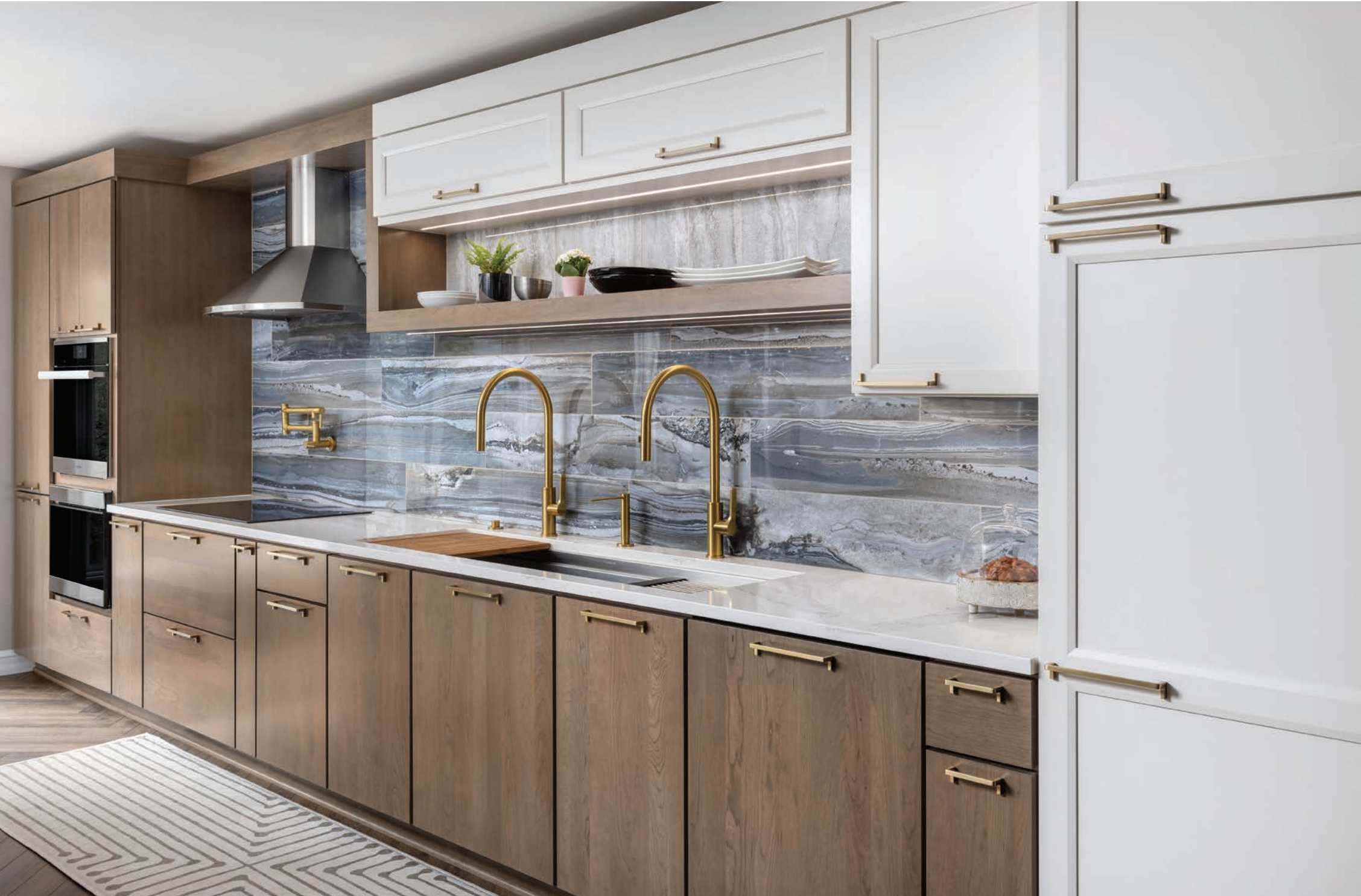
Bria Cabinetry shown in Lauren door style with "Pearl" paint and Camden door style with "Cashew" stain on Cherry.