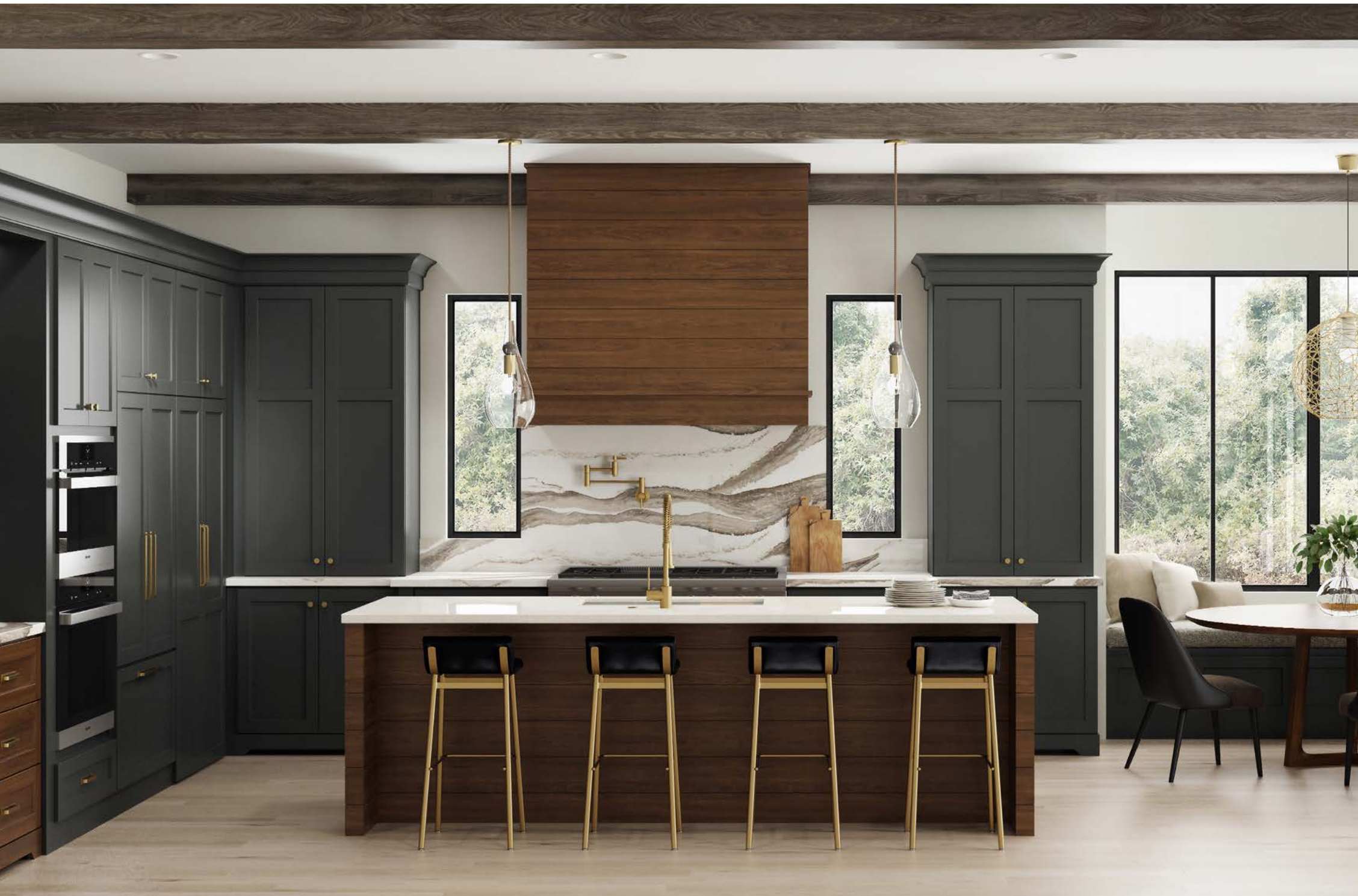
Crestwood Cabinetry shown in Carson Panel door style with "Rock Bottom" paint and "Hazelnut" stain on Cherry.