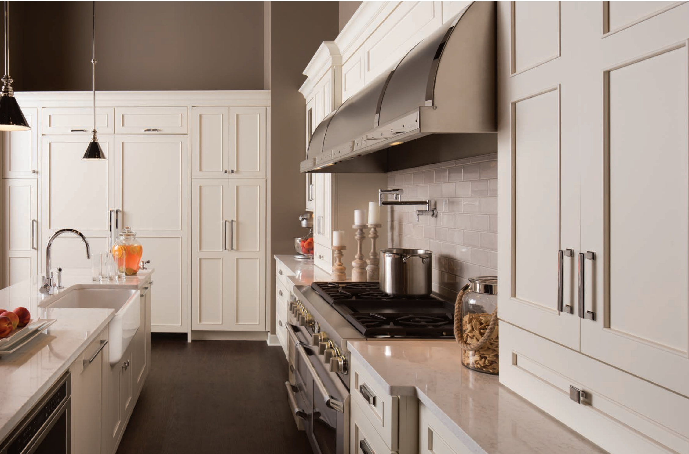
Crestwood Cabinetry shown in Silverton door style with "Classic White" paint. Island cabinetry with a Personal Paint Match finish.