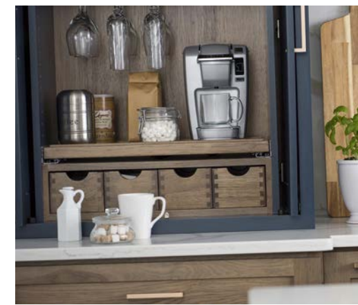
Beverage Center Larder Cabinet

YOU'LL APPRECIATE THEIR HARD WORK! The accessories you select for your Dura Supreme kitchen are as important to the cabinet interior as the door, wood and finish are to the exterior. These hardworking, organizational tools transform your kitchen into an efficient workroom with their ingenious compartments and pull-out mechanisms. Optimize, maximize and organize every valuable inch of your storage space and then sit back, relax and enjoy your hardworking kitchen.