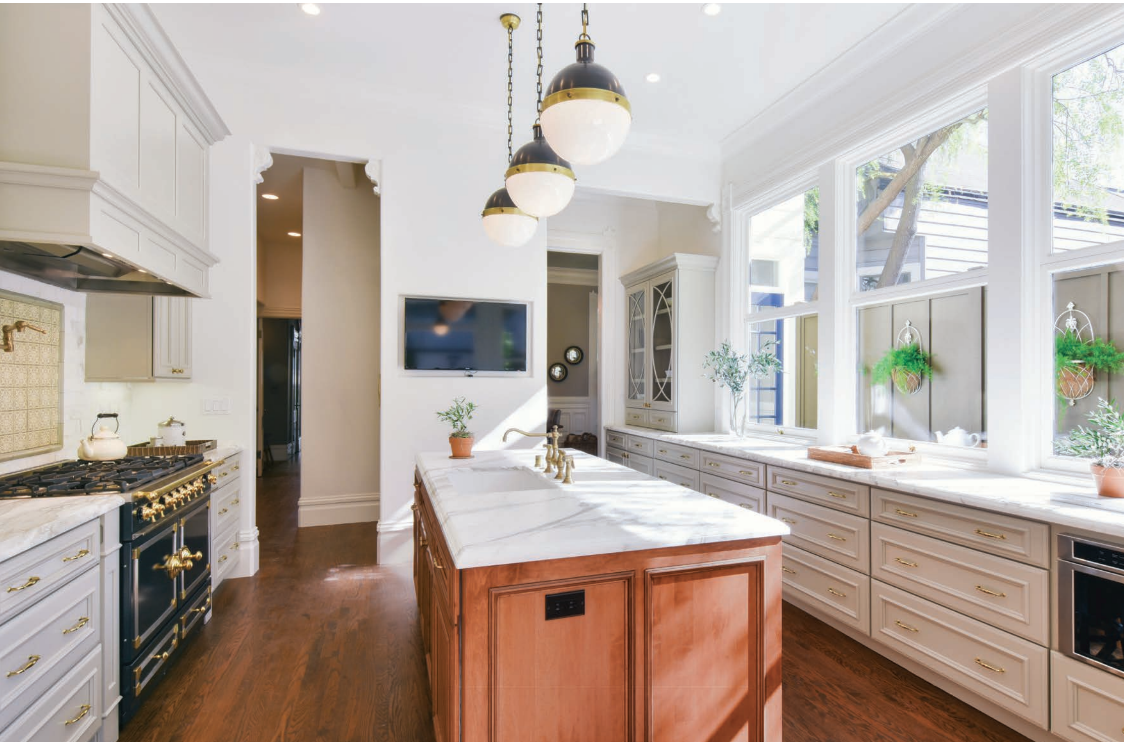
Crestwood Cabinetry shown in St. Augustine door style with "Zinc" paint. Island cabinetry shown with "Clove/Black" stain/accent glaze finish on Cherry.