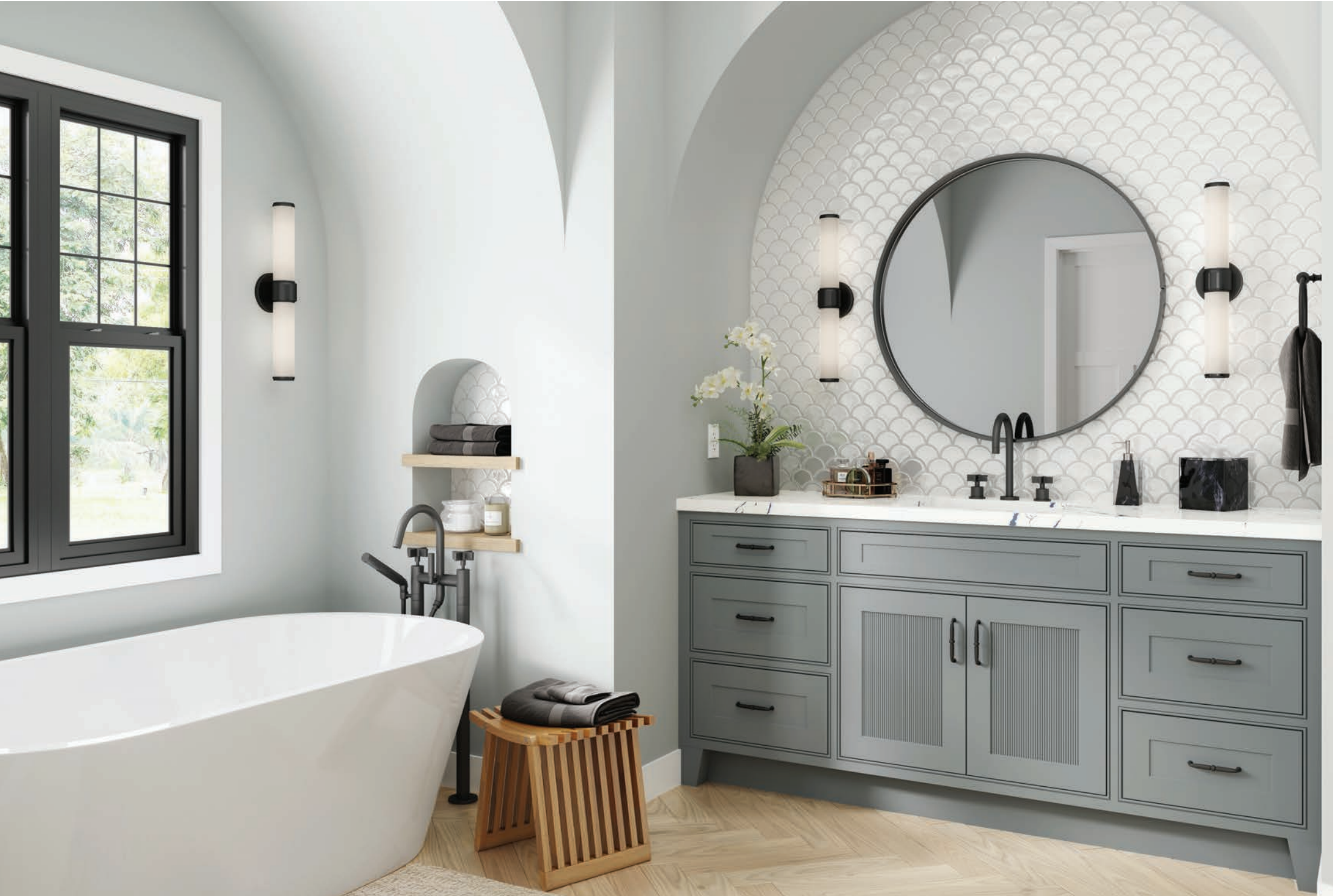
Crestwood Cabinetry shown in Parker Beaded Inset door style with Reeded Panel Inserts with "Software" paint.