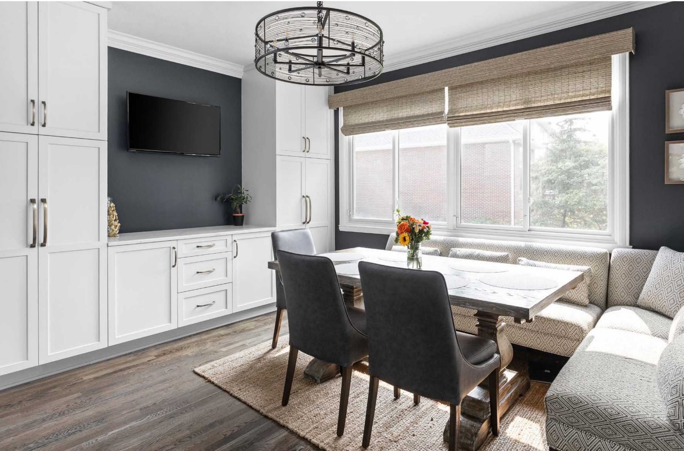
Crestwood Cabinetry shown in Hudson door style with "White" paint.