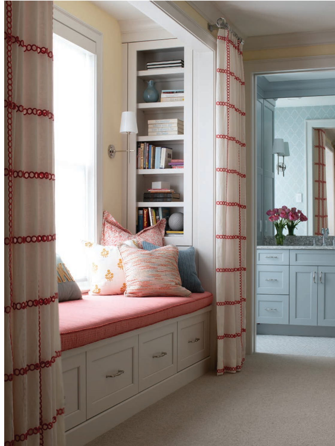
Bria Cabinetry shown in Highland door style with "Linen White" paint in reading niche and custom blue paint in bathroom.