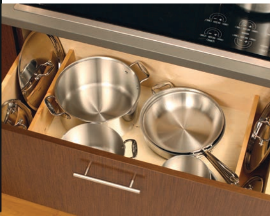
Side Partitions for Lid Storage