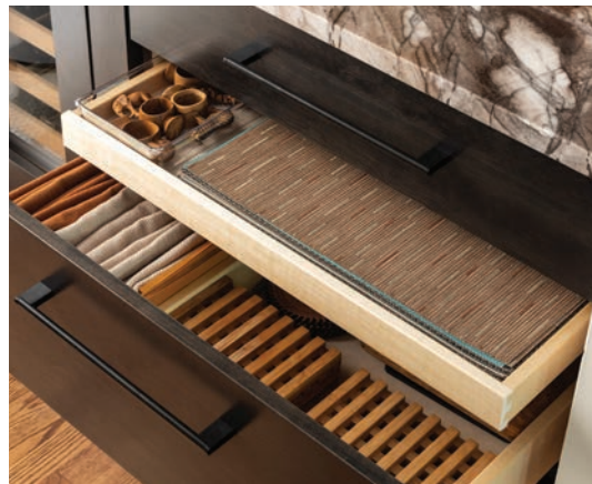
Shallow Roll-Out Above Drawer