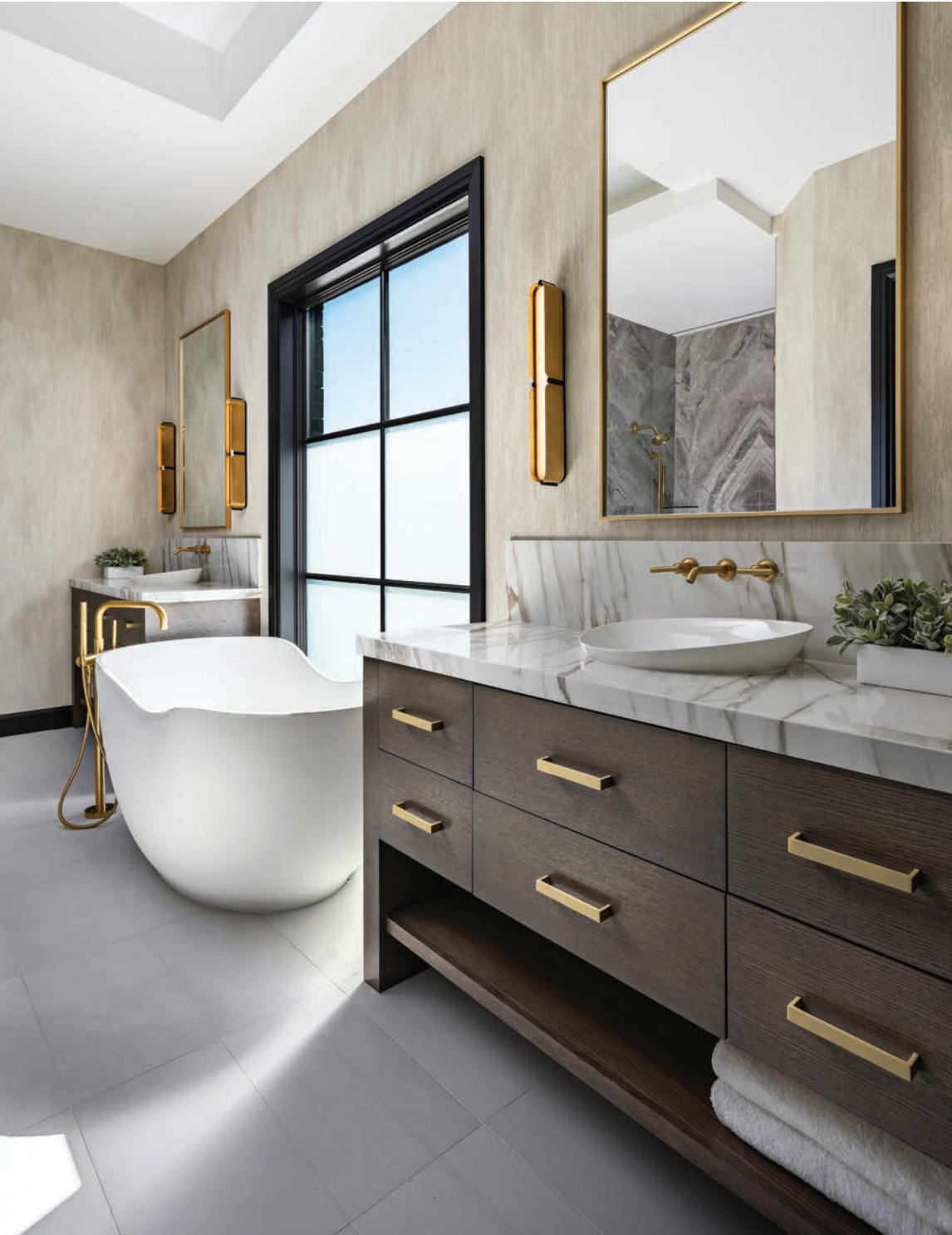
Bria Cabinetry shown in Moda - Horizontal door style with "Praline" stain on Quarter-Sawn White Oak.