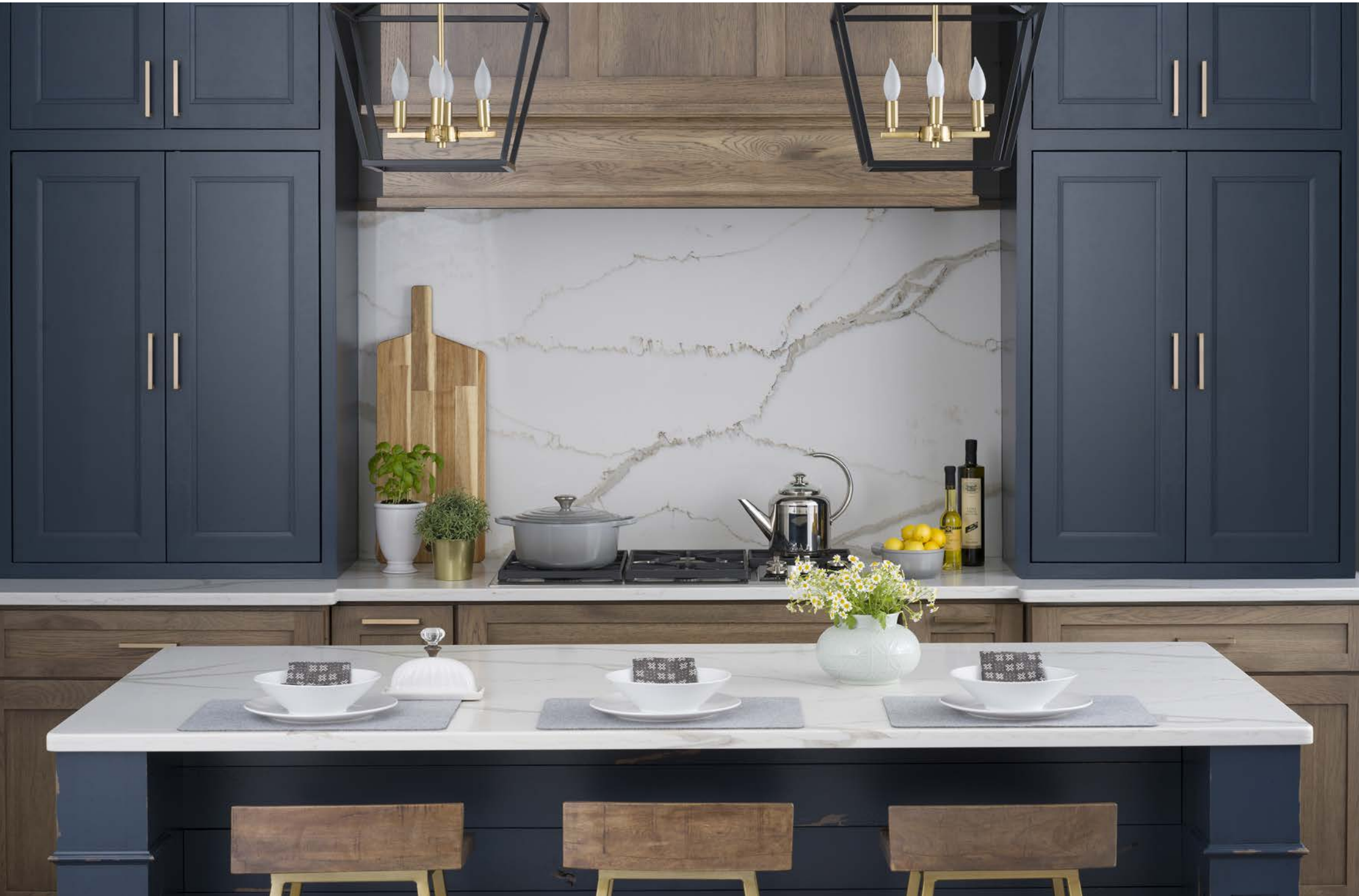
Crestwood Cabinetry shown in Dempsey Inset and Craftsman door styles with “Gale Force” paint and “Morel” stain on Hickory.