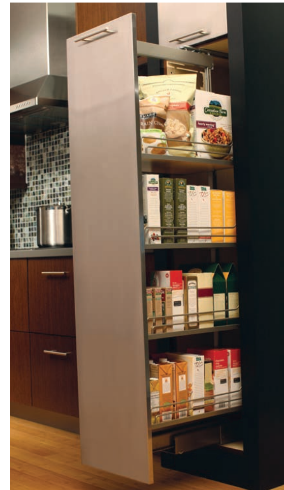
Tall Pull-Out Pantry